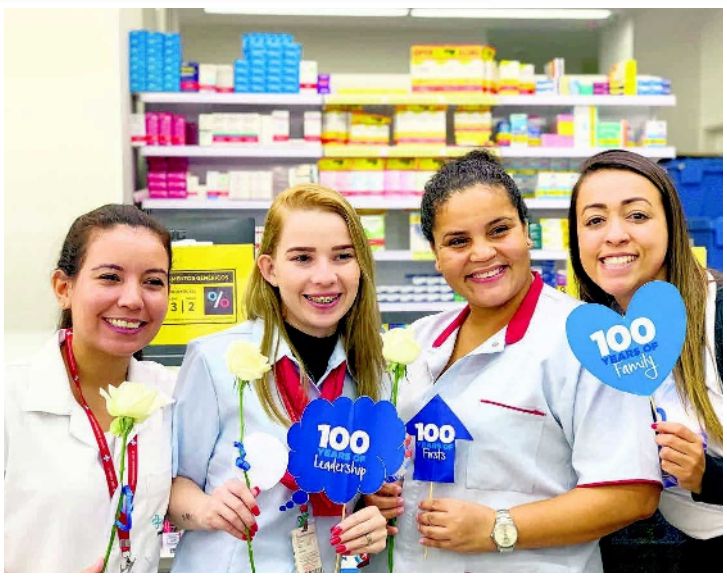
Hilton Rio de Janeiro.