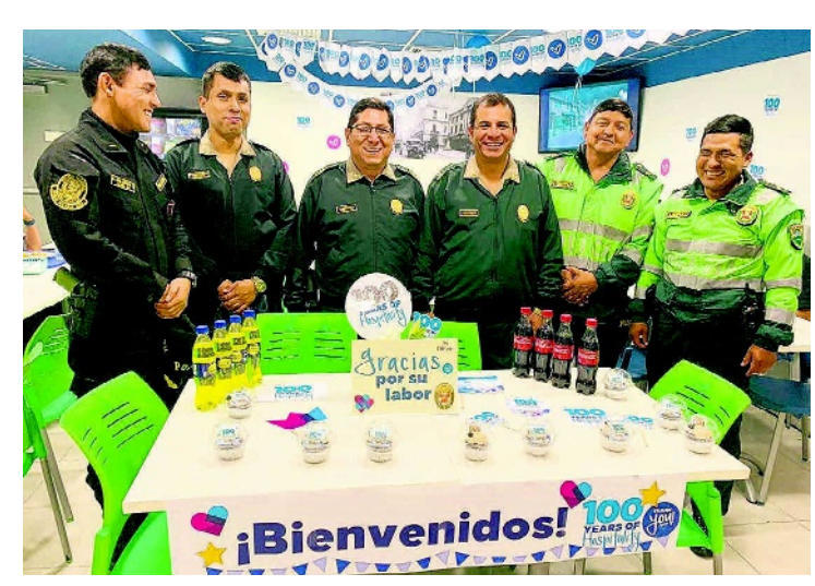
Hilton Lima.

impact already driven by Hilton through its Travel with Purpose corporate responsibility strategy, which seeks to double the