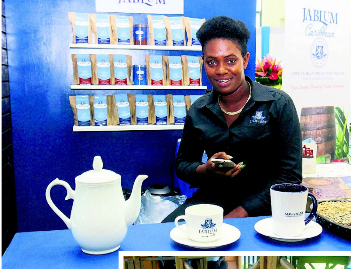
A Jablum Coffee representative serving coffee at the recent Jamaica International Exhibition.

Jamaican Blue Mountain coffee has the distinction of being labelled the world's finest and is one