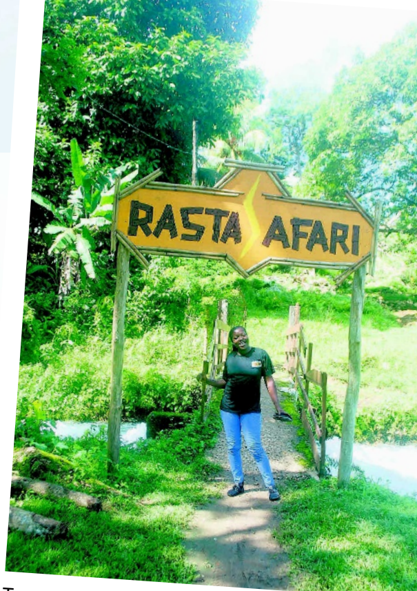
you at the beginning of the tour.

"This Negril tourism belt that they have here; we are the buckle on that belt," Findlay said.