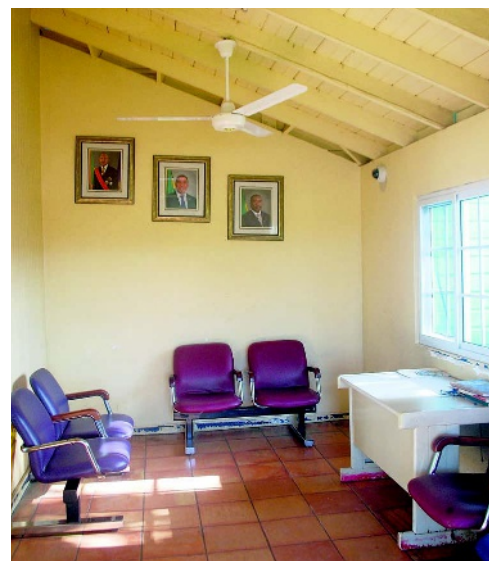
Waiting area at Negril Aerodrome.