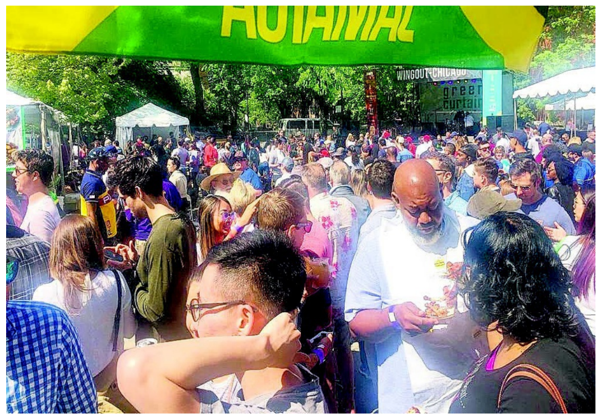
Patrons enjoying Wingout Festival

the ultimate competition in women's football. The 53rd-ranked Reggae Girlz is one of four debutants at this year's World Cup, joining Chile, Scotland, and South Africa.