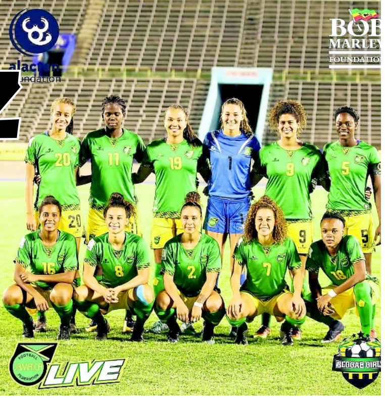
The Reggae Girlz