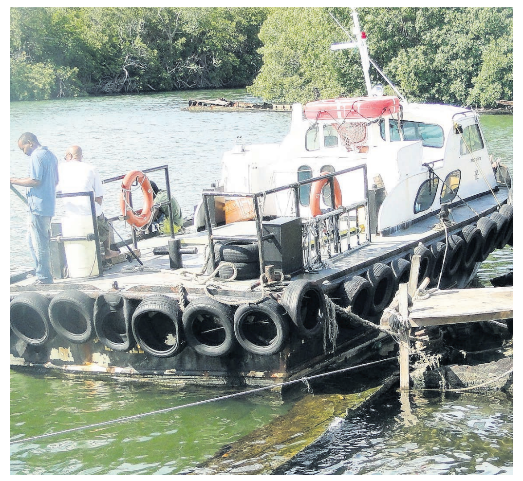
People fishing from a tugboat at Salt River Port in Clarendon.