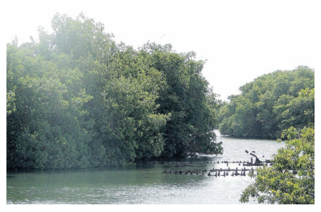
A waterway that barges laden with sugar used to travel along to reach Salt River Bay, off the coast of Clarendon.

Wisco was founded on May 22, 1937, around the Frome Estate in Westmoreland, with an initial capital of £600,000. It was