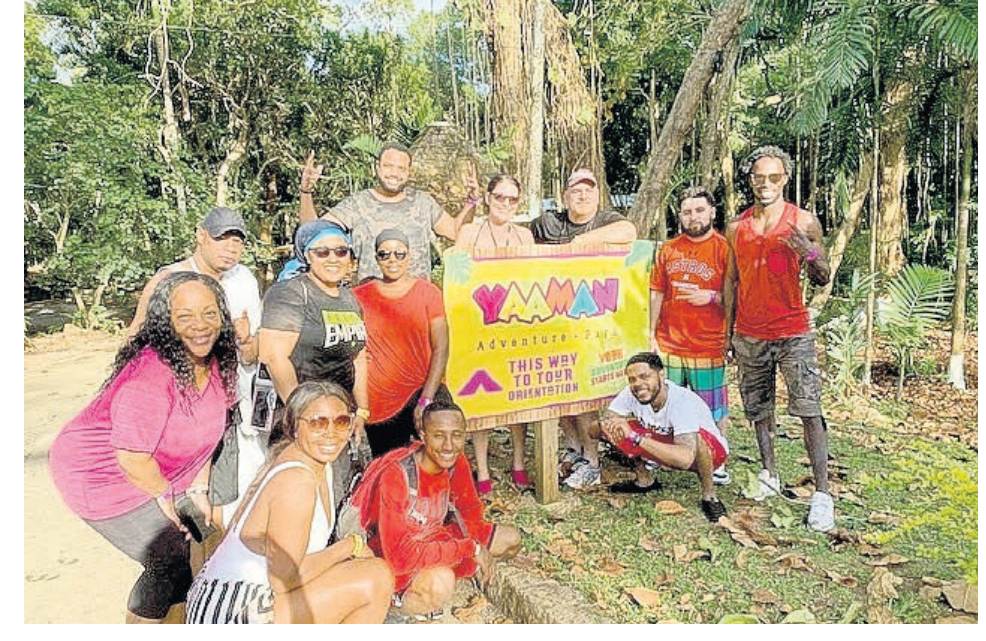
Enjoying Yaaman Adventures are members of a six-market radio remote broadcast. Moon Palace Jamaica was the accommodation partner.

Radio stations have been hosted from the following major target markets: Atlanta, Baltimore, Boston, Charlotte, Chicago, Cincinnati, Cleveland, Dallas, Denver, Detroit, Houston, Jacksonville, Kansas City, Las Vegas, Miami, Milwaukee, Minneapolis, Nashville, New York, Orlando, Philadelphia, Phoenix, Pittsburgh, Portland, Providence, Richmond, Rochest er, Springfield, Tampa, Topeka, West Palm Beach, Wilmington, and Worcester.