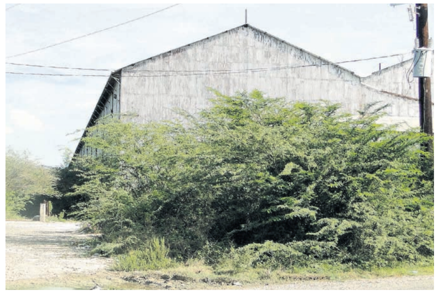
Another abandoned warehouse at Salt River Port in Clarendon.