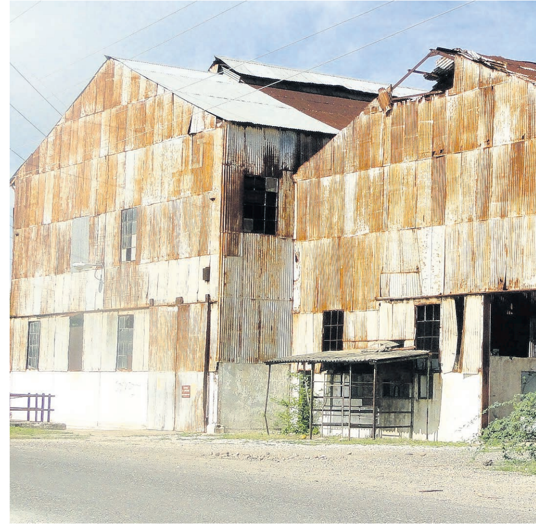
Rusting Wisco warehouses.