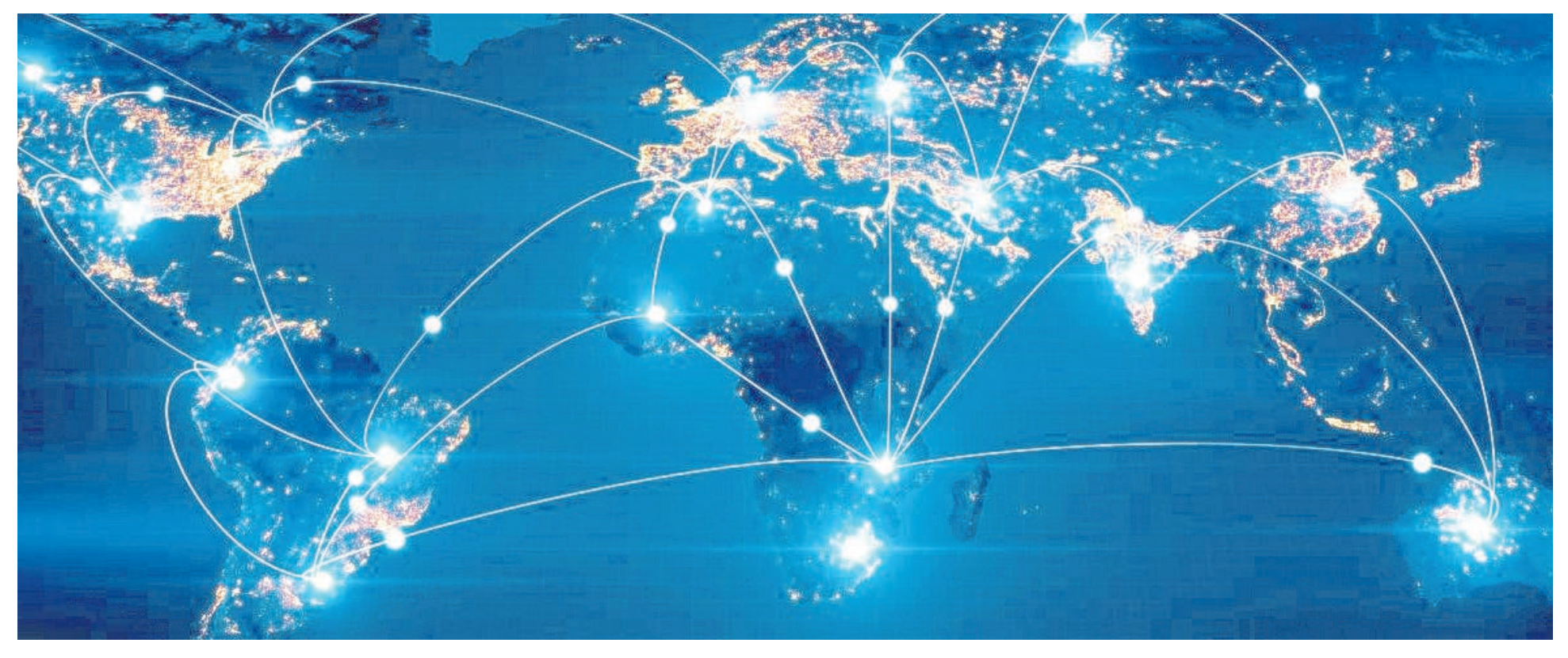
Connecting the dots from city to city.