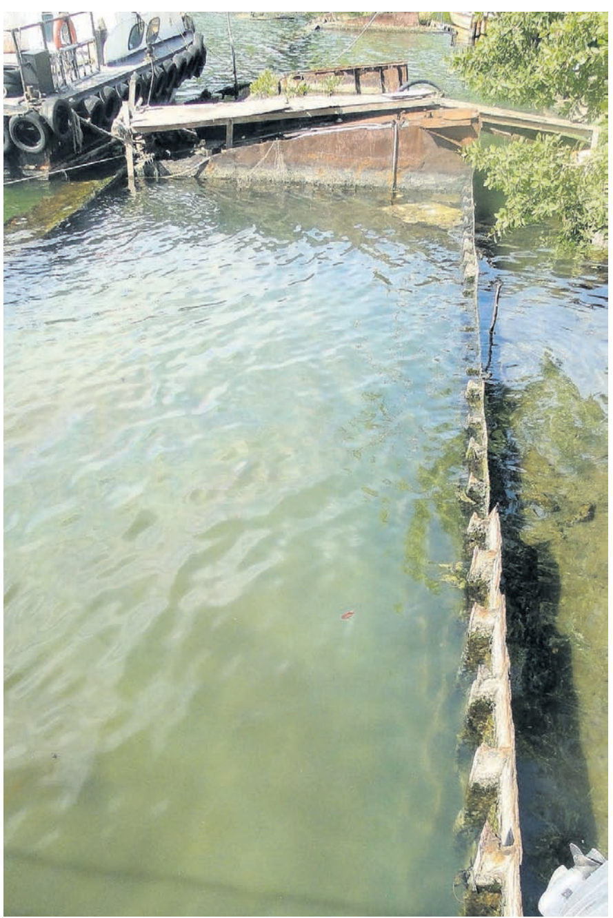
A decomposing barge that used to carry sugar to ships docked at Salt River Bay.

Wisco reigned supreme in the era when sugar was king, and with the decline of the industry in Jamaica, the sweet rewards dissipated, and eventually became diluted. The decomposing metal barges at Salt River, which I chanced up, have stories to tell, yet slowly and surely they and the narratives they hold will be buried in the murky depths.