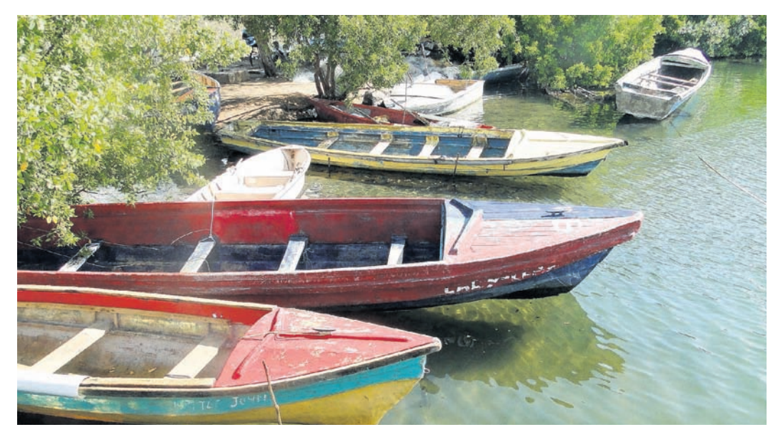
The abandoned port at Salt River in Clarendon is now used as a base for fishermen in the area.