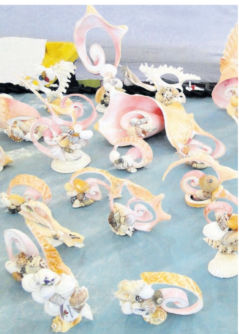
Sensational pieces from Shellsation.