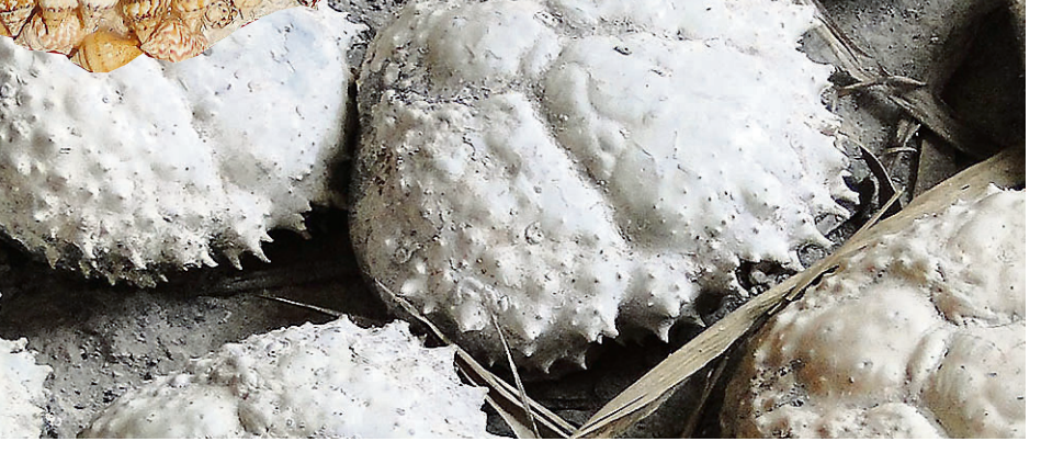
A section of the façade of Dr Errol Miller's 100-room limestone wall museum at Kendal in Manchester.

A cabinet of ornamental shells. A cat figurine made of shells.