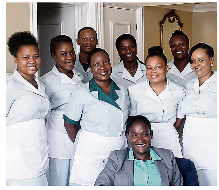
The housekeeping team at Courtleigh Hotel and Suites.

The Courtleigh Hotel and Suites is also nominated as 'Jamaica's Leading Business Hotel for this year's World Travel Awards, which will be staged later this year in Montego Bay.