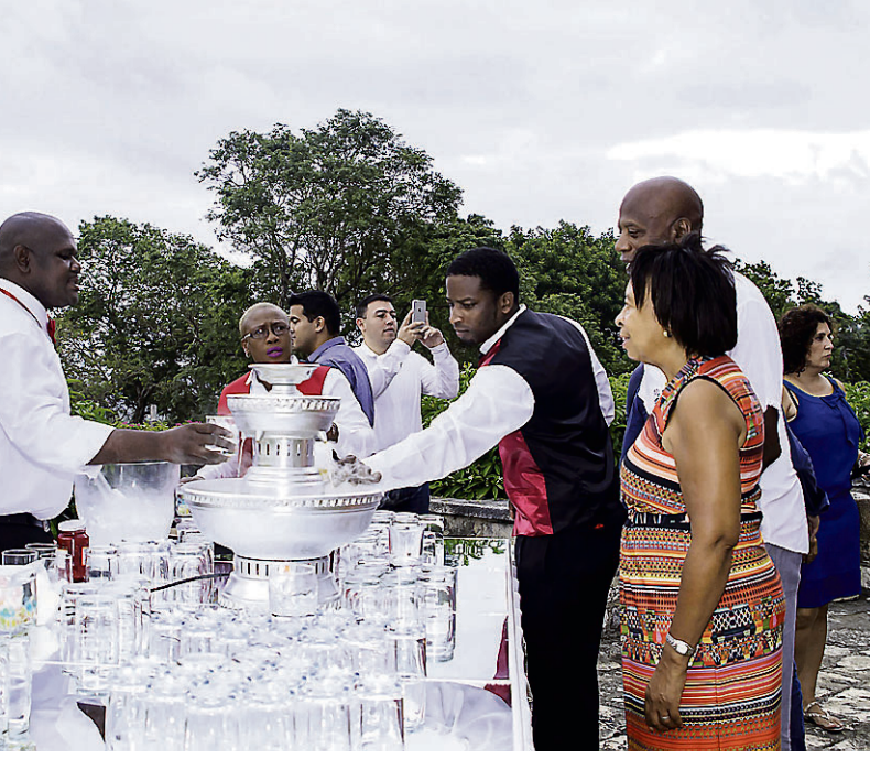
The bar was a popular spot for guests at Rose Hall Unites.