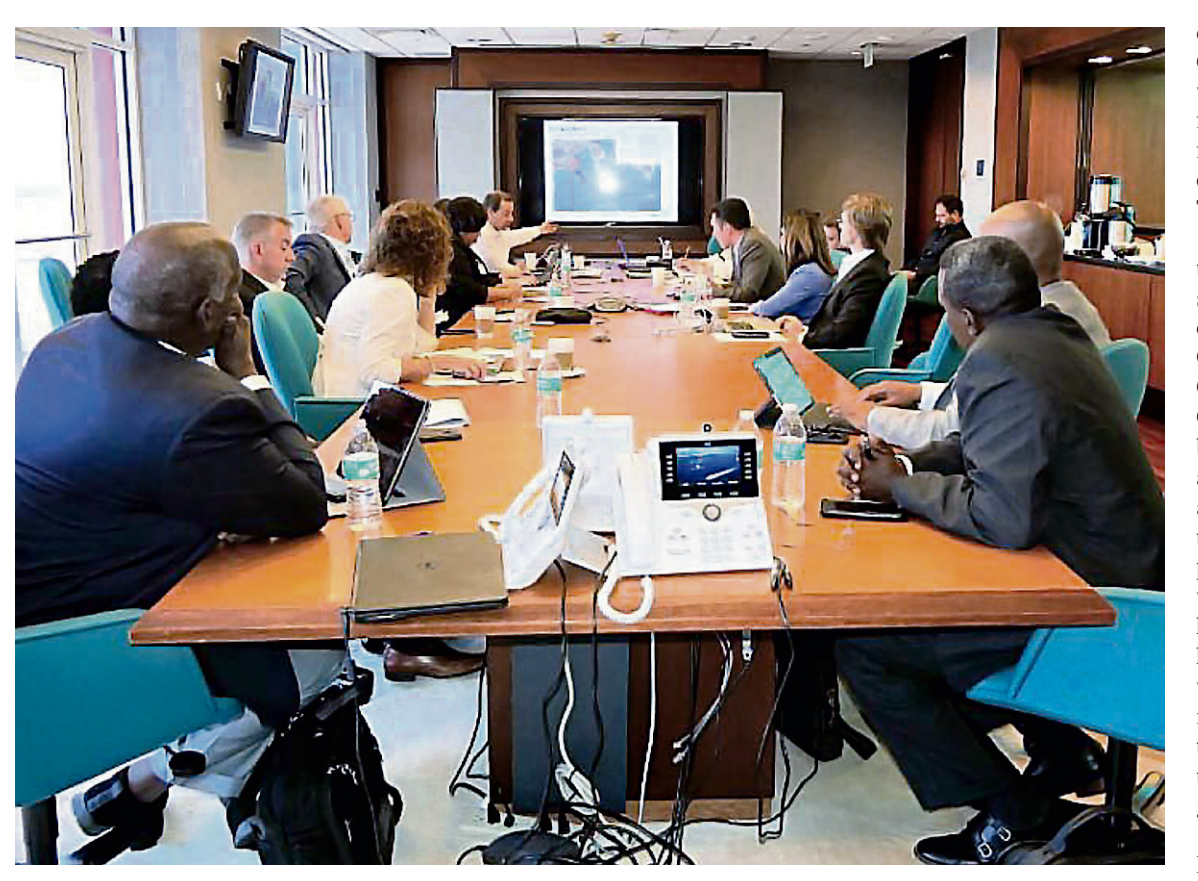
USVI cruise leaders meeting with Florida Caribbean Cruise Shipping Association executives in Miami.

outlined the department's updated Crisis Communications preparedness plan and the department's new Purpose in Paradise 'voluntourism' programme. The programme was