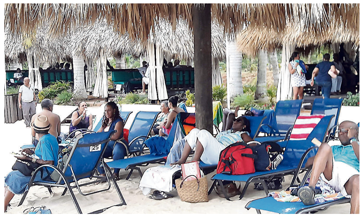
Locals and foreigners are flocking to the new, Puerto Seco Beach.

The beach is home to nine cabanas, a large, full-service restaurant, and Wibit, which made its way all the way from Germany