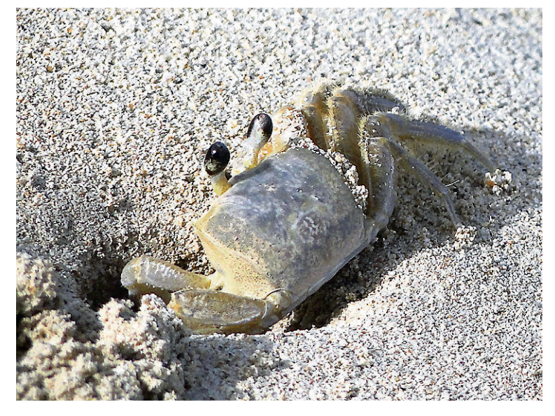
Sandcrabs such as this one live in holes on Sunset Beach in Montego Bay.

One of the enchanting vistas at Sunset Beach in Montego Bay.