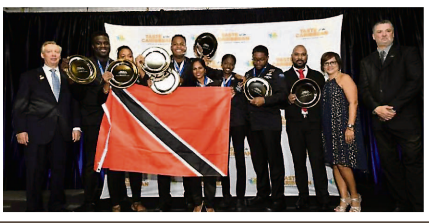
Trinidad & Tobago's winning team celebrates with CHTA and Taste of the Caribbean representatives.