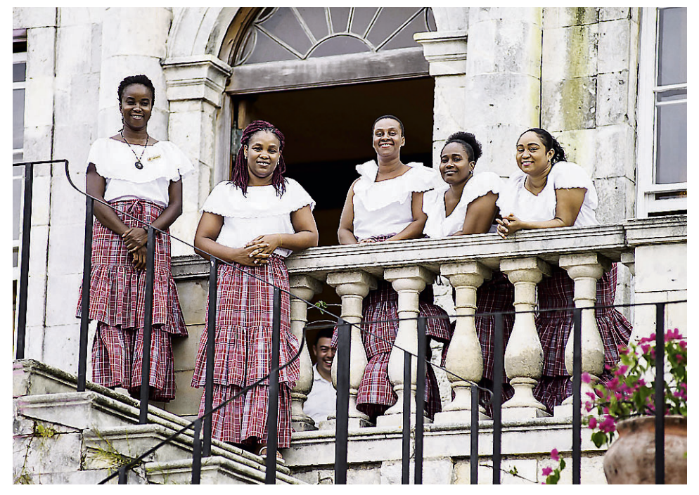
Hostesses at the Rose Hall Great House were a welcoming scene for persons attending Rose Hall Unites.