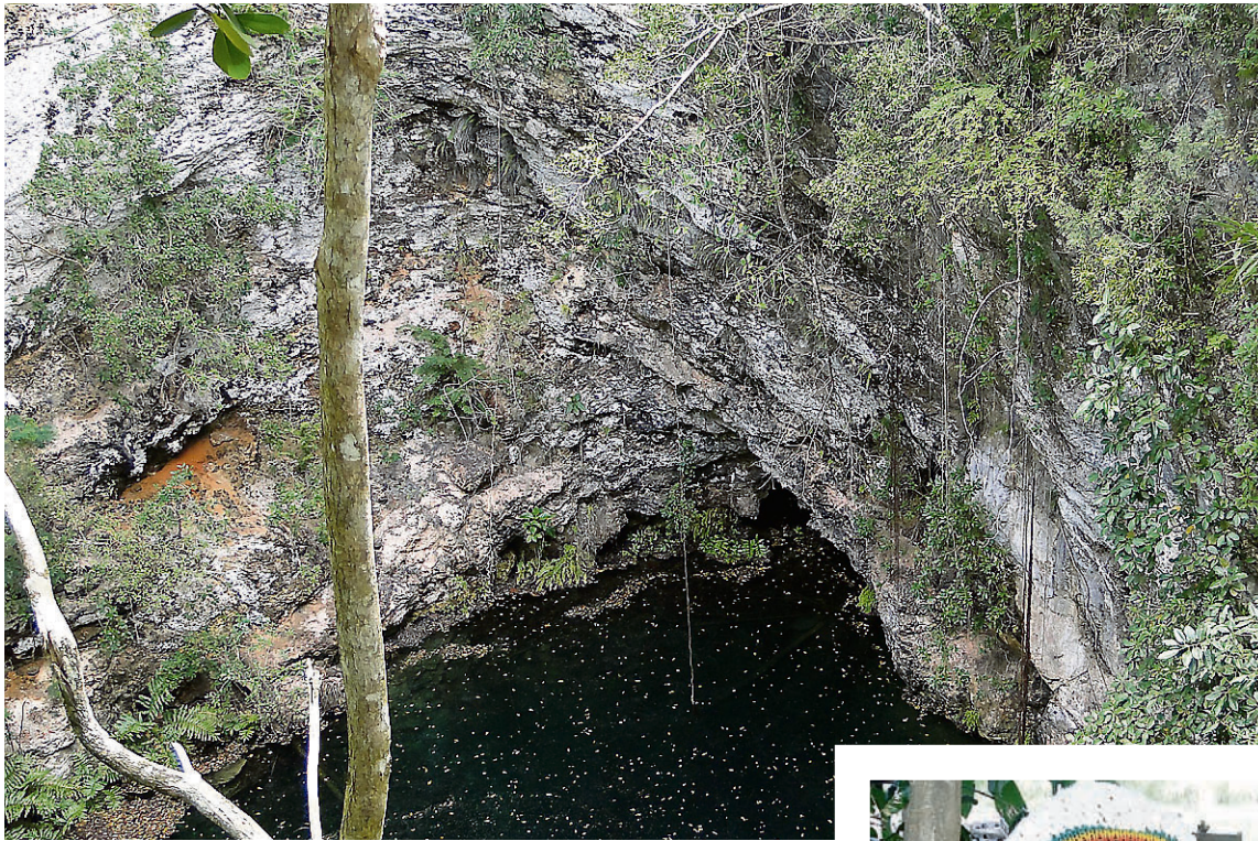
A view of part of the water inside God's Well, a massive sinkhole, located in the Clarendon section of Canoe Valley.