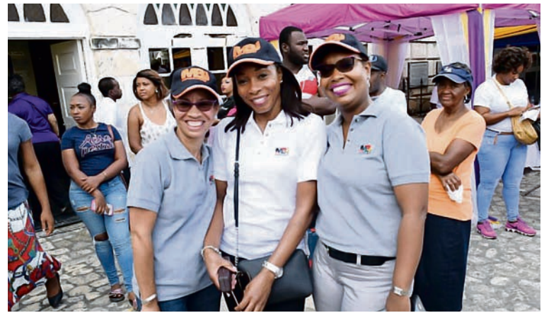
The MBJ team