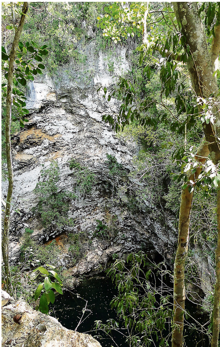
The sheer drop of a section of the mountainside into God's Well in the Clarendon section of Canoe Valley.

LEFT Kingston with some friends on Saturday, April 21, feeling very excited. I was on my way to see God's Well, located in the Canoe Valley of Clarendon and south Manchester, with some people I met two years ago.