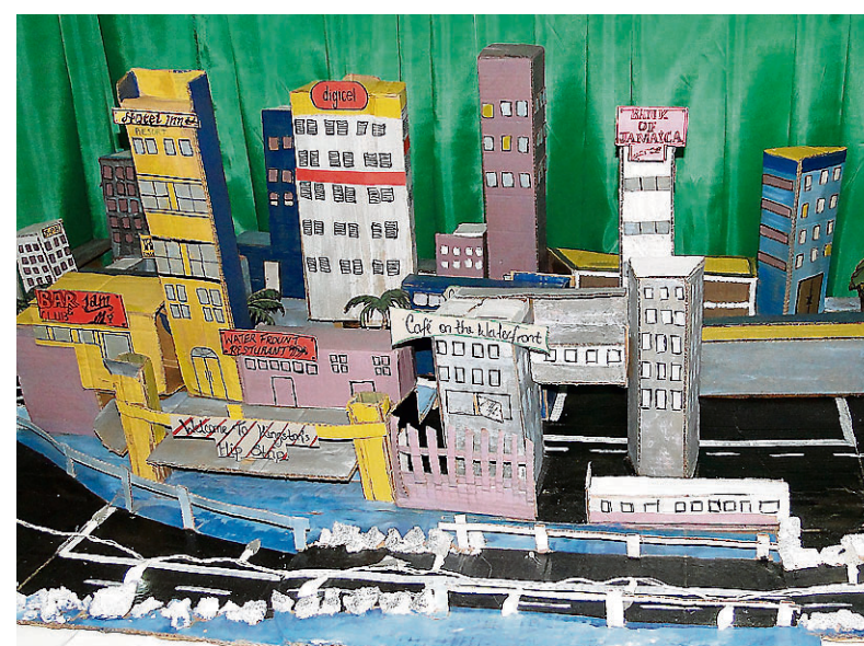
A model of the Kingston waterfront, created by T3M.