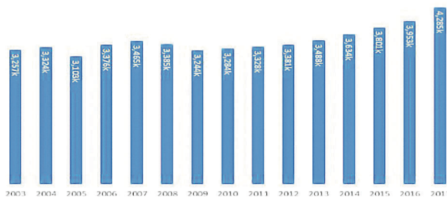
Total Passengers 2003-2017