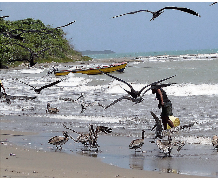
Scavenger birds swoop in for fish entrails on Alligator Pond beach in Manchester.

vertigo swirled in. I could not believe it.