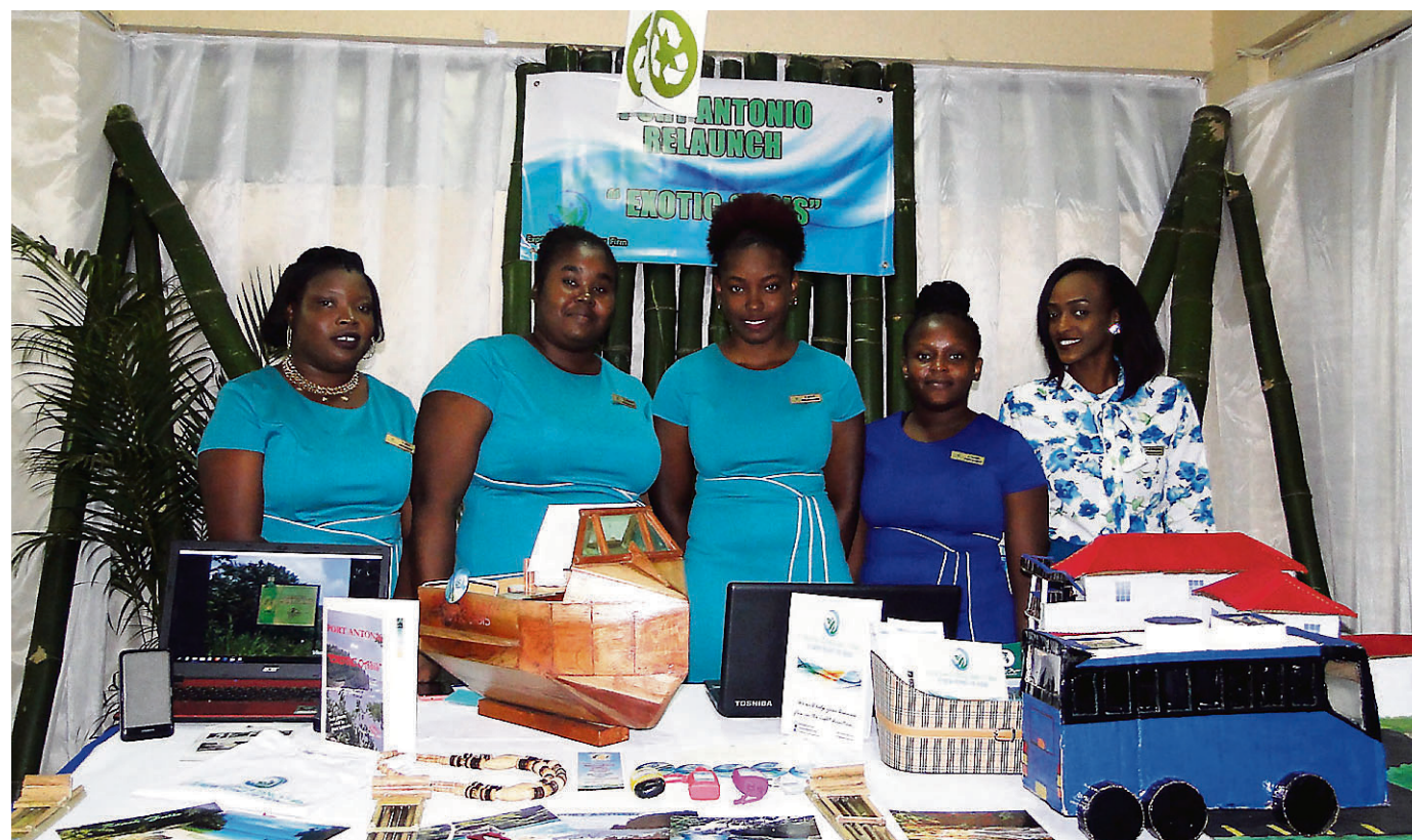
Experiva Consultancy Firm, the team that wants to diversify the tourism products in Portland.