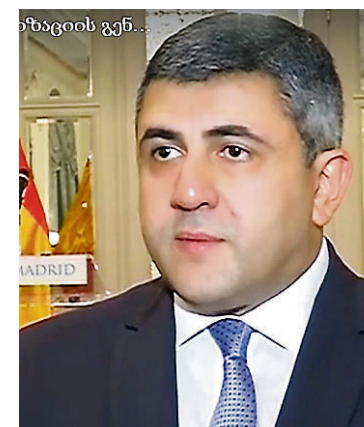
New UNWTO Secretary General Zurab Pololikashvili

■ Create cooperation mechanisms among educational institutions at all levels, the private sector, governments, and technology partners to review educational programmes and skills development policies; ■ Consider the importance of SMEs in the tourism, heritage, and cultural sectors due to their contribution to job creation as well as their role in preserving and promoting cultural resources; ■ Promote the use of digital technology to facilitate travel as well as involve technology stakeholders in national tourism policies