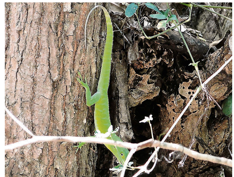
The population of this type of lizard has dwindled in Jamaica, but they thrive in Canoe Valley in south Clarendon and Manchester.