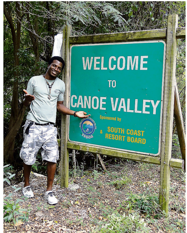
Canoe Valley, spanning south Clarendon and south Manchester, is a region known for its rich biodiversity.

Then, it was unspeakable joy when I saw Taino clay pot and pipe remnants at a spot where an elderly farmer brought us. I was beside myself, as I have always wanted to find such a spot. There were several remnants lying on top of the red soil. Yet, in all of this, what I still cannot get over is the blue turtle painting on one of the little clay pieces. Why? One of the pendants I wore that day is that of the image of a turtle. Coincidence