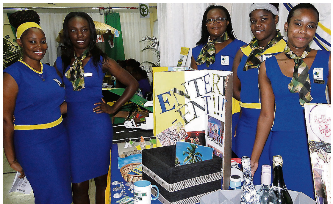
Perfectos, the team that intends to make Negril the town that never sleeps.

Starting in the east, the lush, green parish of