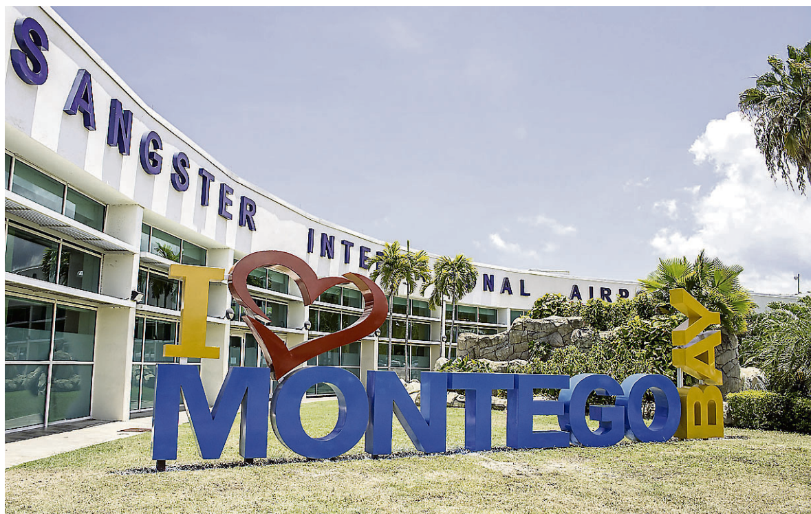
The new 'I Love Montego Bay' sign unveiled at the Sangster International Airport.