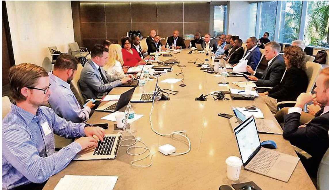
The Florida-Caribbean Cruise Association’s Operations Committee meeting in Miami last month.

The relationship between the trade group and the US Virgin Islands is very firm. “It goes way