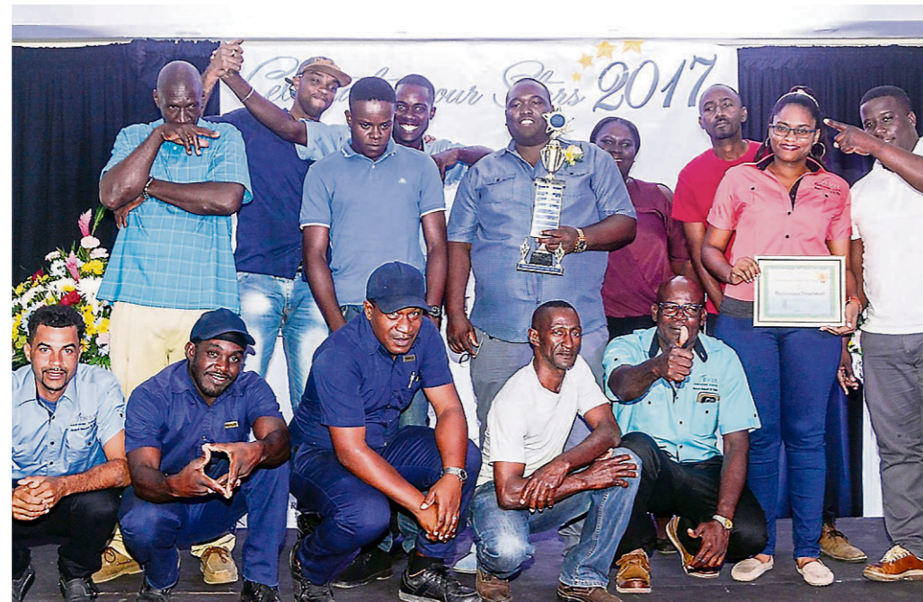
Department of the Year at Jewel PC, Maintenance.