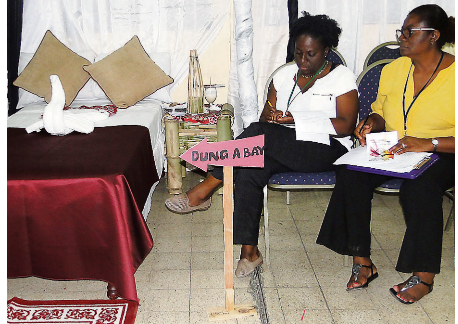
Beside a bed, set up by Jam Creators Communication, evaluators listen keenly to a presentation.