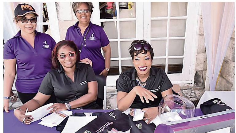
The Caribbean Airlines team at the MBJ Airports Limited 15th anniversary expo in Sam Sharpe Square

www.atljamaica.com | Twitter YouTube Instagram Facebook @atlunbeatable