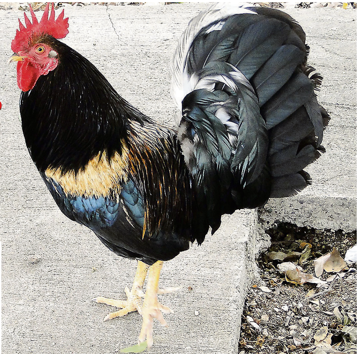
This majestic rooster could not help but strike a pose for Hospitality Jamaica at Alligator Hole in south Clarendon recently.