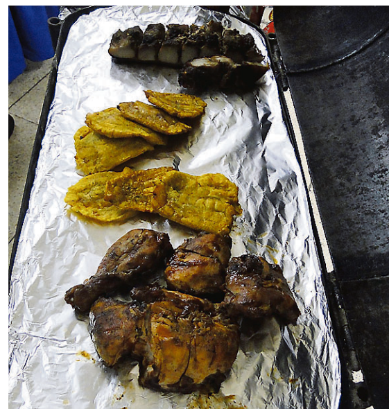
Portland jerked food, prepared by Experiva Consultancy Firm.