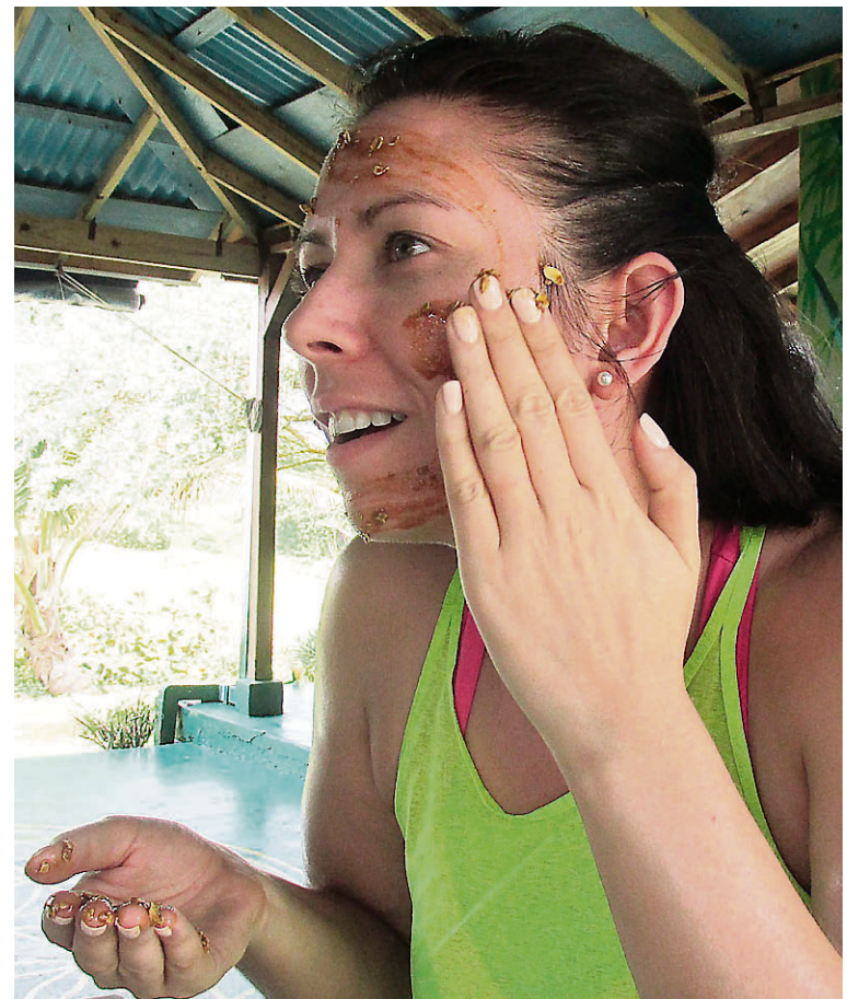
Guests at Go Natural show off their natural products.

And in keeping with the philosophy of the business, the food served is natural, the type that was not nurtured by man-made chemicals. The meals provided may be communal or tailored to suit individual