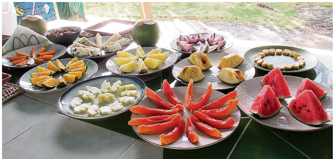
It's breakfast time at Go Natural. Yes, breakfast!