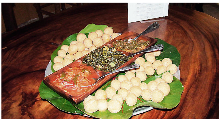
One of the African-inspired dishes, created and served by Café Africa at the recent opening of Africana House.