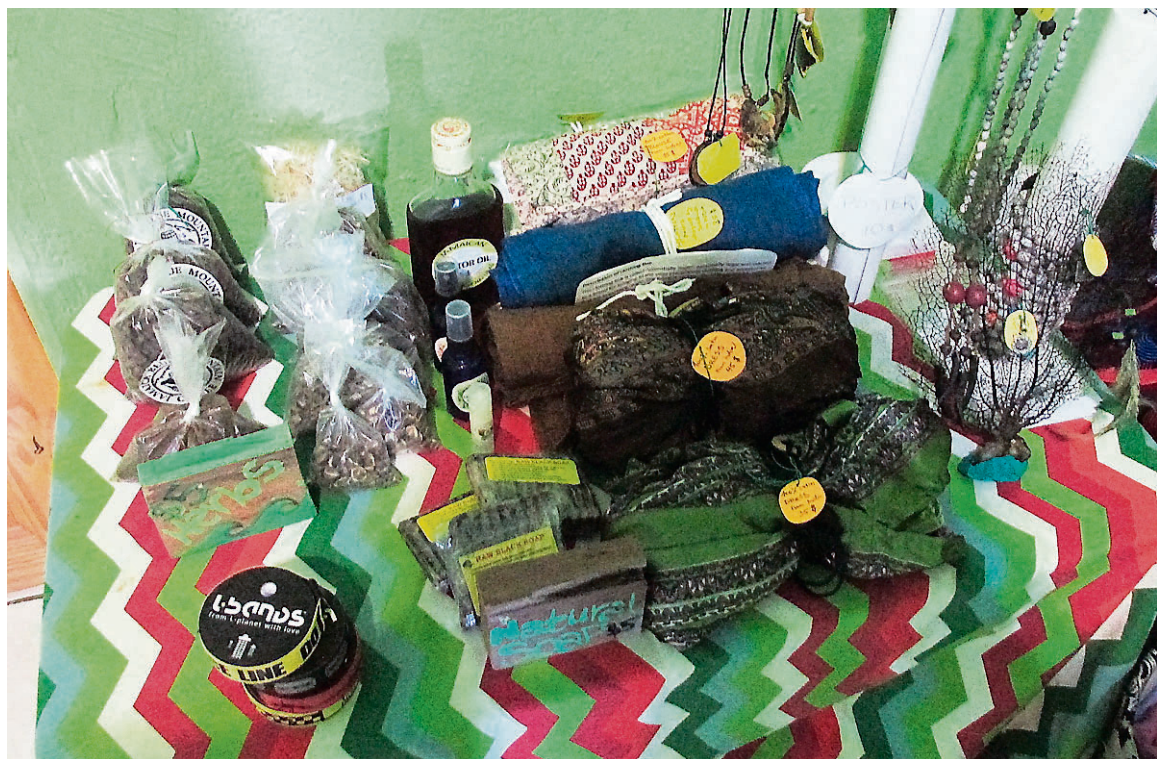
Some of the natural products made at Go Natural.