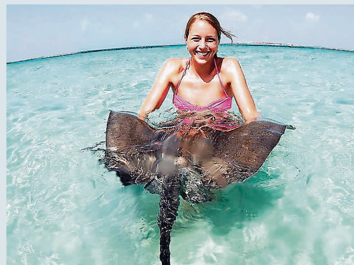
A guest holding a stingray on Chukka's Reef and Rays tour in Grand Turk.

For this reason, the US's loss may well become the Caribbean's gain.