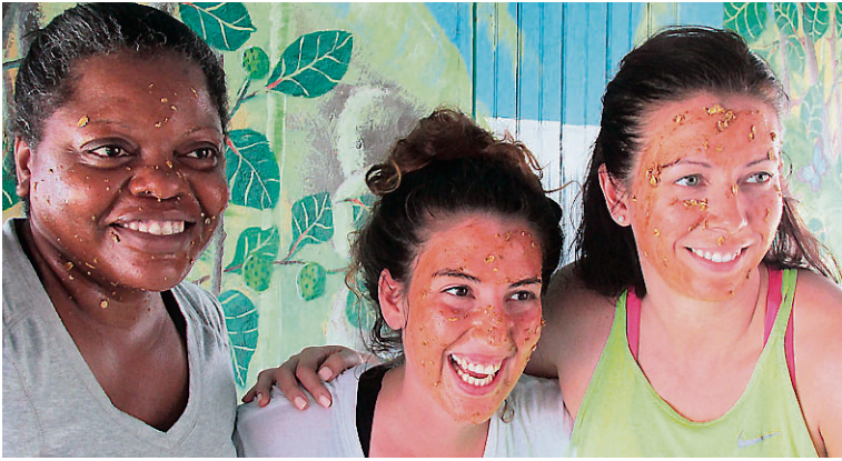
Guests at Go Natural show of their natural skin-exfoliation masks.