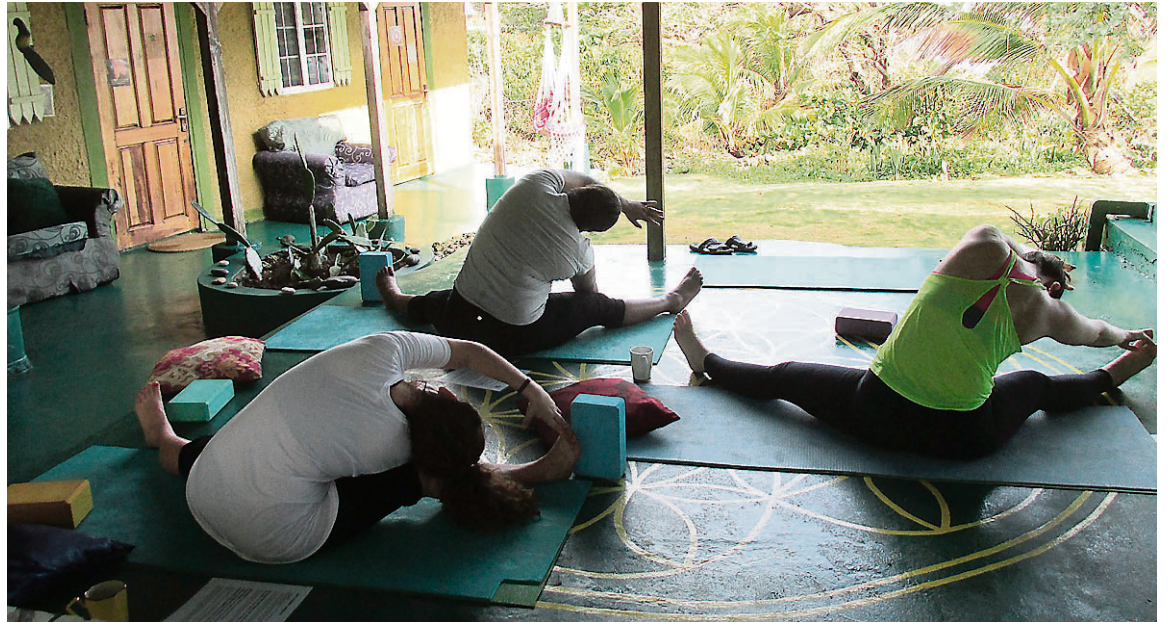
Yoga in session at Go Natural.