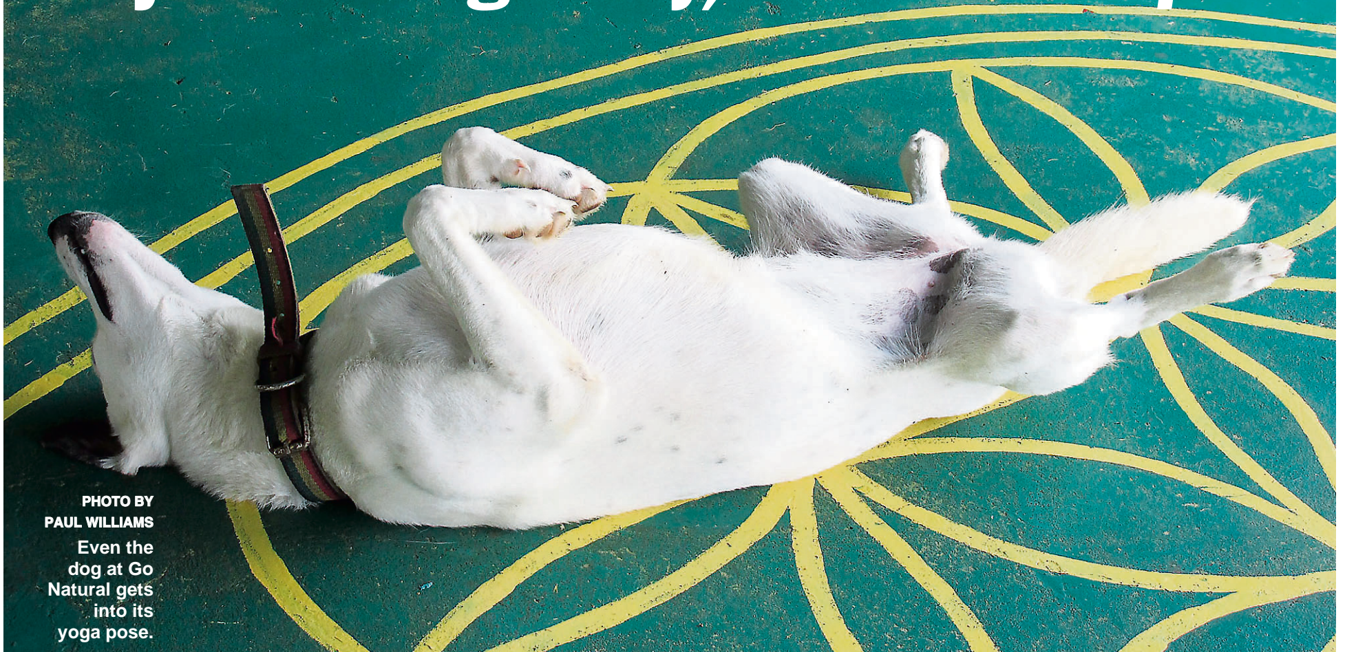
Even the dog at Go Natural gets into its yoga pose.