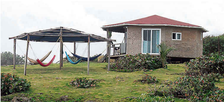
The hammock gazebo and a villa at Go Natural.