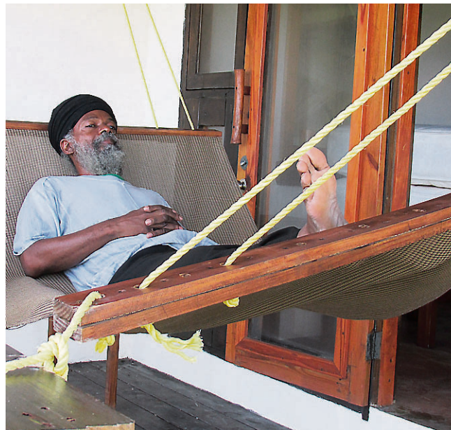
At Sea Hanger Resort and Spa, the living is easy.