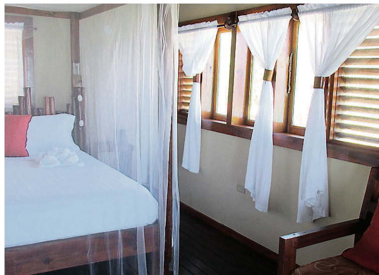
Inside one of the breezy rooms at Sea Hanger Resort and Spa at Ross Craig in Portland.