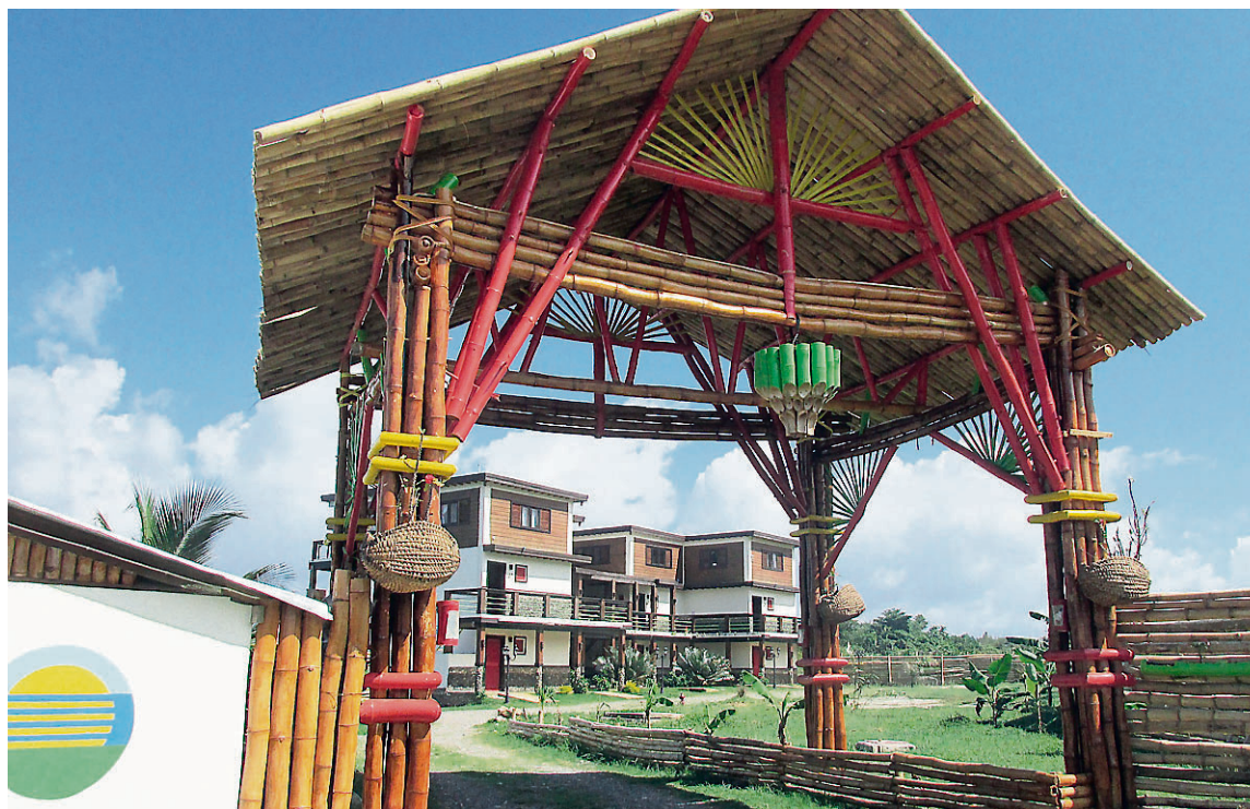
Opened November, last year, Sea Hanger Resort and Spa at Ross Craig has added 15 rooms to the Portland tourism landscape.