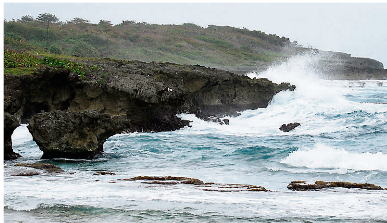
Waves crashing against jagged rocks off the coast at Go Natural.

'White horses' continuously gallop to the shore in the alcove that ends with a small beach of fresh, shallow, crystal-clear water. When the water is still, small schools of colourful fishes can be seen. Weathered driftwoods, small, bleached honeycomb rocks, and pebbles of various shapes and sizes complete the beautiful picture of seaside ecology.