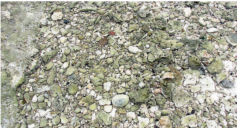
The crystal-clear water on the beach at Go Natural.

needs such as those of the vegan or raw-food dieters. A breakfast consisting only of a variety of fruits is an example of a regular repast to start the day.