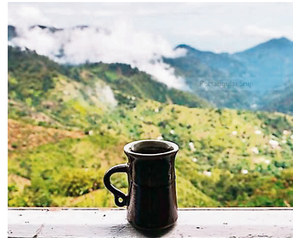
At left: 'Vagabrothers' captures a scene in the Blue Mountains.