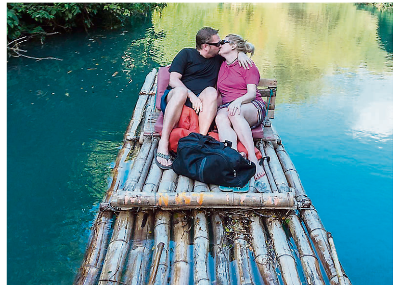
Love is in the air as 'The Planet D' takes a romantic trip rafting on the Martha Brae.

Don't be a spectator, come #FeelTheVibeJamaica. To share in their experiences and to plan your own Jamaican itinerary go to www.feelthevibejamaica.com or follow @visitjamaica; #feelthevibejamaica; #homeofallright; #livefunner.