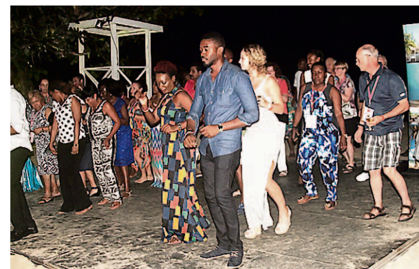
Guests and staff dancing up a storm at the JTB reception at Melia Braco Village on Heroes Day.