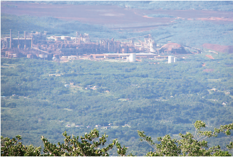
View of an alumina plant in St Elizabeth from Lincoln, Manchester.