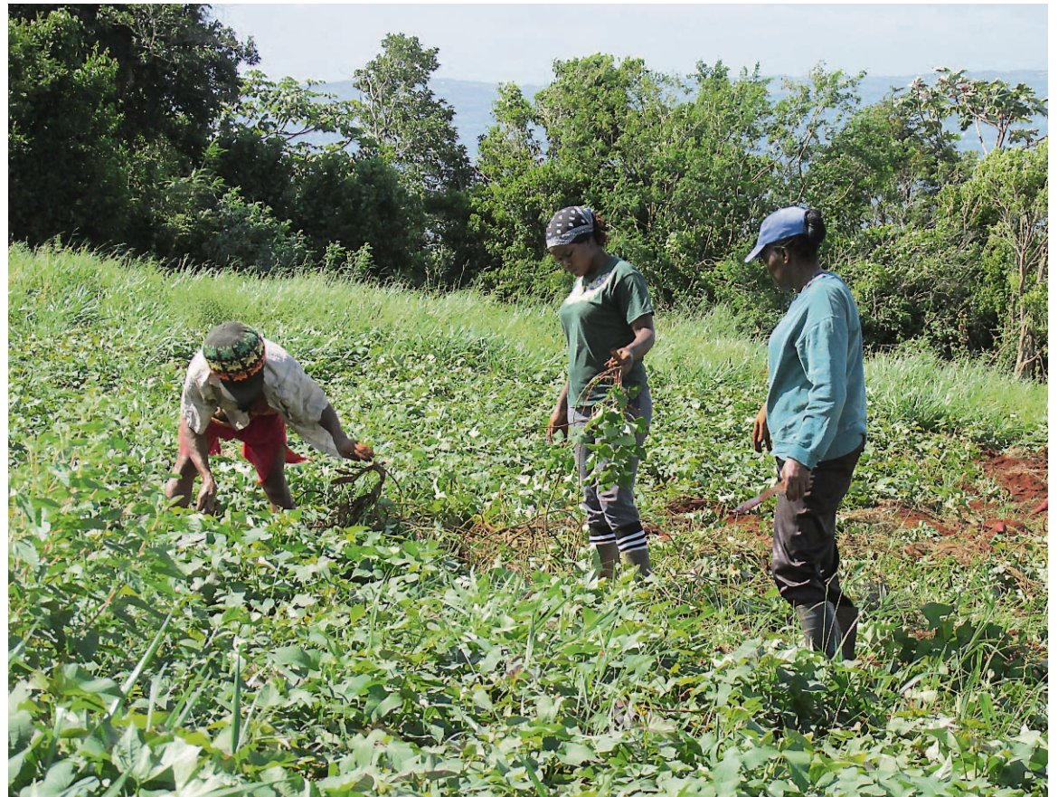
People reaping sweet potatoes on a mountainside in Lincoln, Manchester.

my feet into it. Heaven! The older woman said she would not have done that. She was in waterboots and knew not what she was missing.