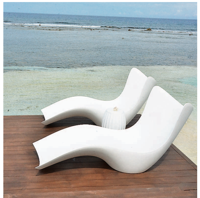
Sandals Royal over-water suite balcony jutting out into the sea.