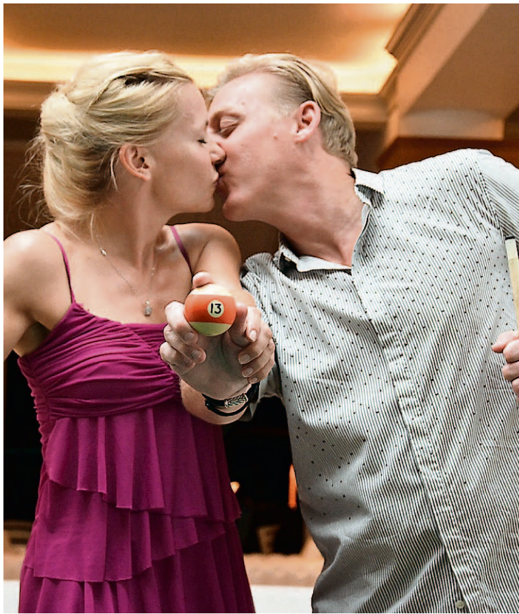
A couple pauses to kiss during a game of pool at Sandals Barbados.

the ocean from their private infinity pool and Jacuzzi with outdoor shower.