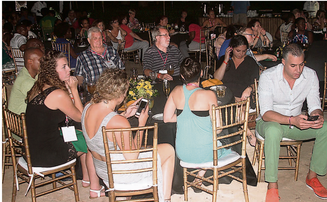
Some of the 80 travel agents hosted by Melia Braco Village.