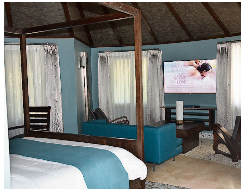
A suite at Sandals La Source Grenada.