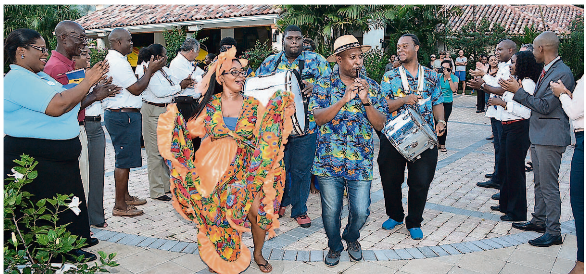
The welcome party for Jamaican media at Sandals Barbados.