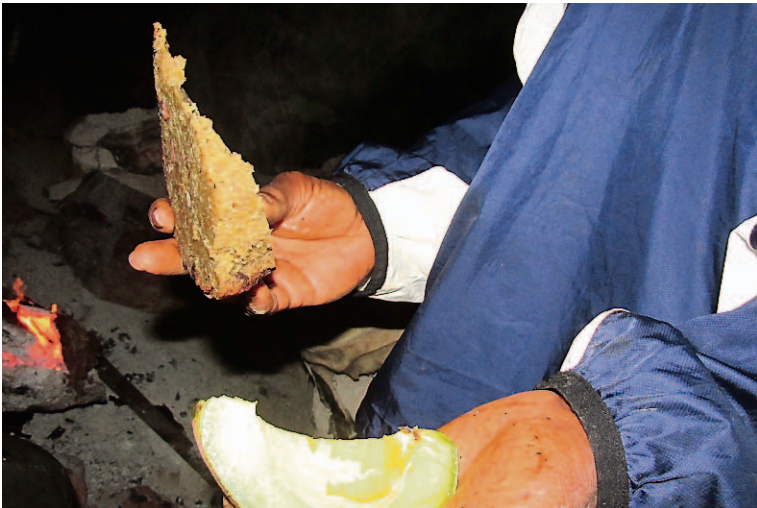
'Pitata' pone and pear, if you will.