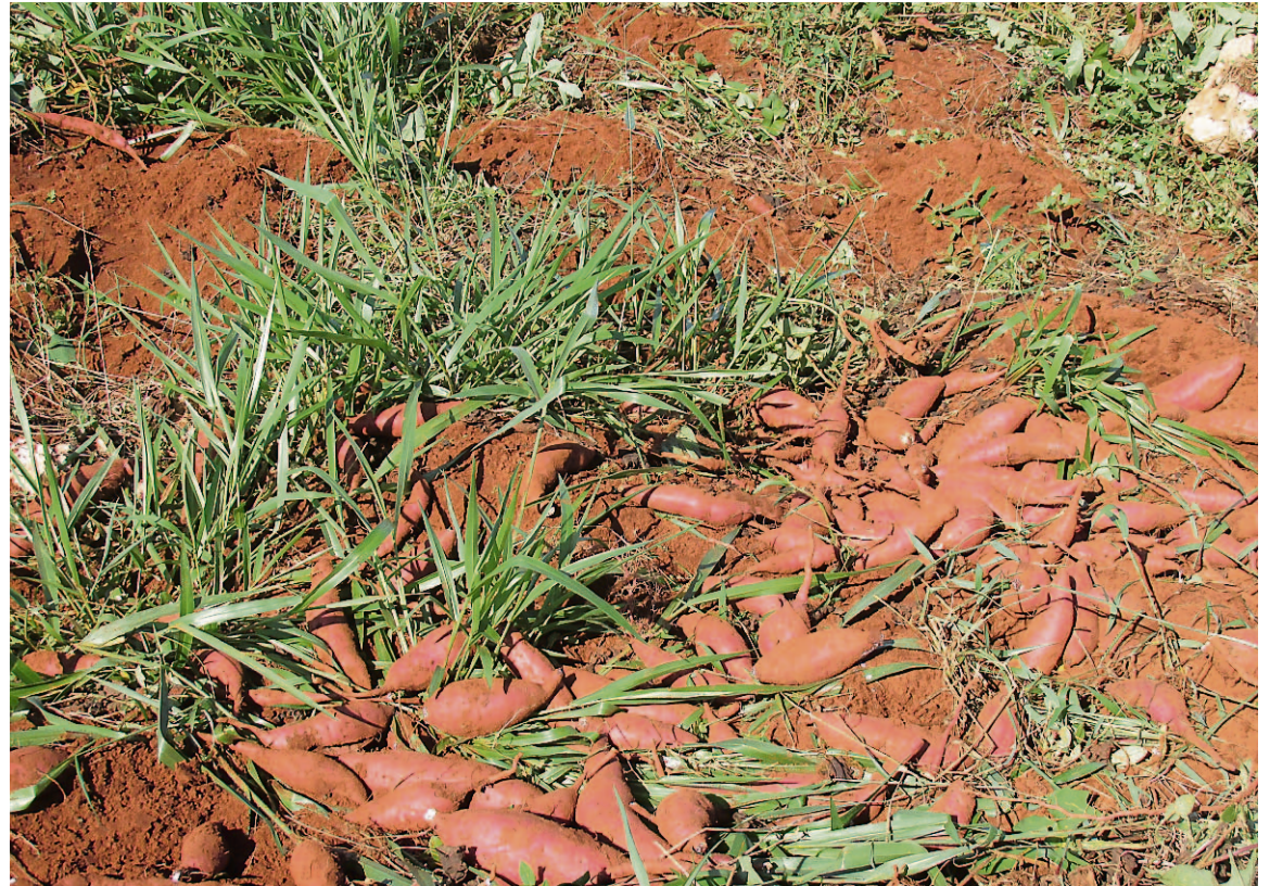
Freshly reaped potatoes.

More joy pervaded my being when I saw the red earth from which they were pulling potatoes. I felt it. Cool. Slightly moist. Loose. I walked out of my sandals and dug