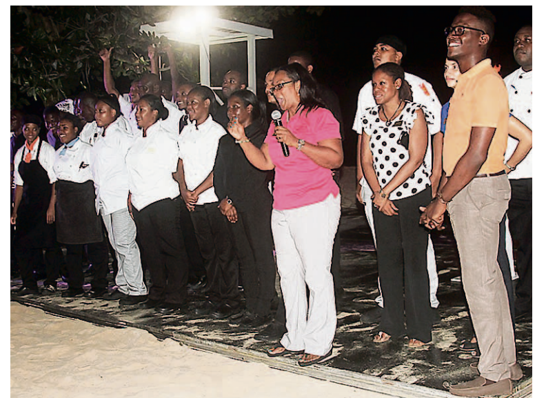
Team Melia, the group that hosted the agents.