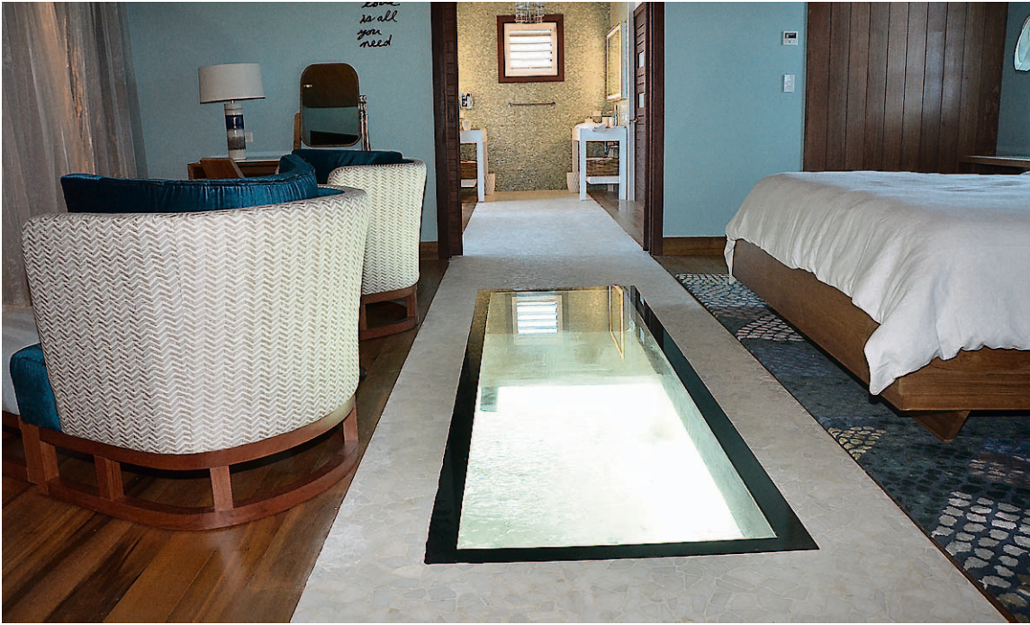
A lateral view of the bedroom into the luxurious bathroom.