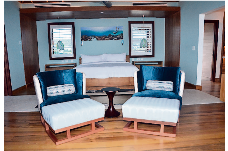
The over-water suite adorned with a stylish mahogany king-size bed.