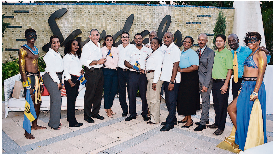
The Sandals Barbados team poses for the camera.