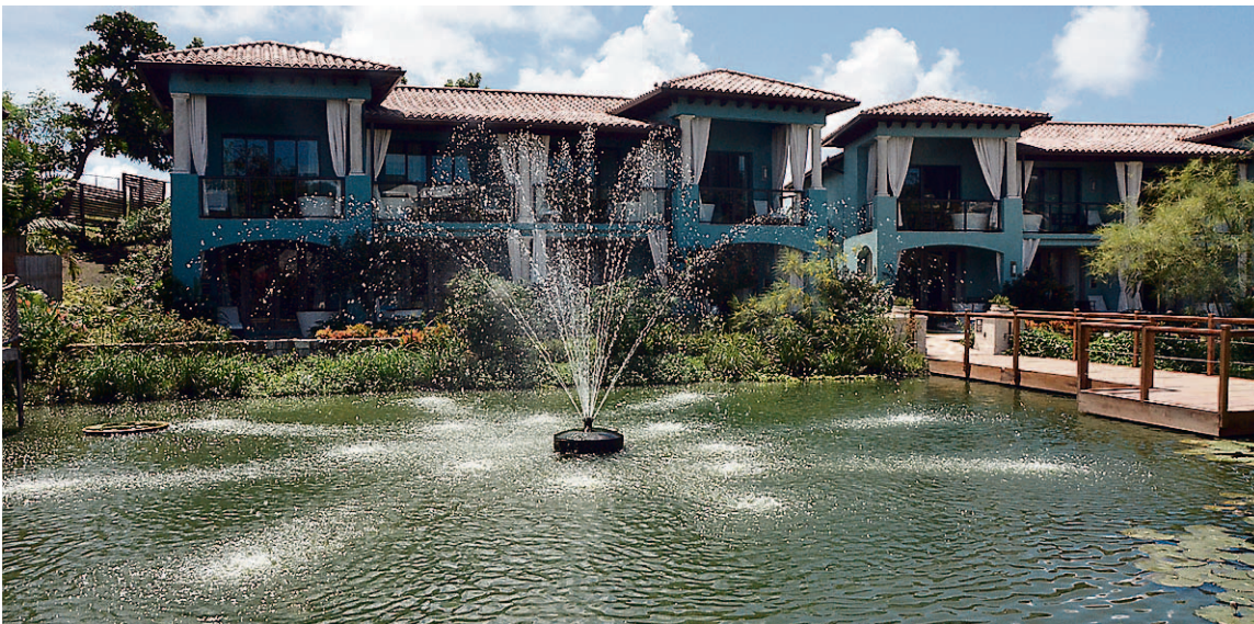
New garden rooms at Sandals LaSource in Grenada.