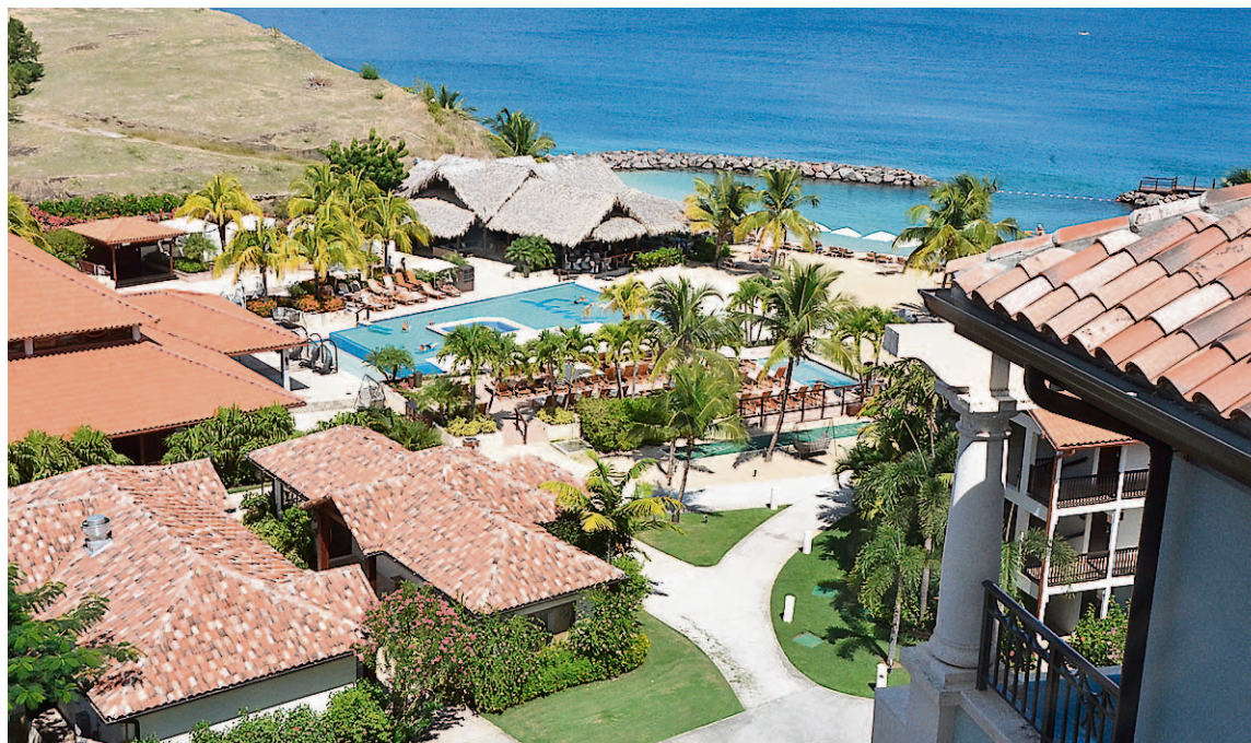
Sandals LaSource Grenada.

claim to being the first hotel to offer over-water butler suites in Jamaica.